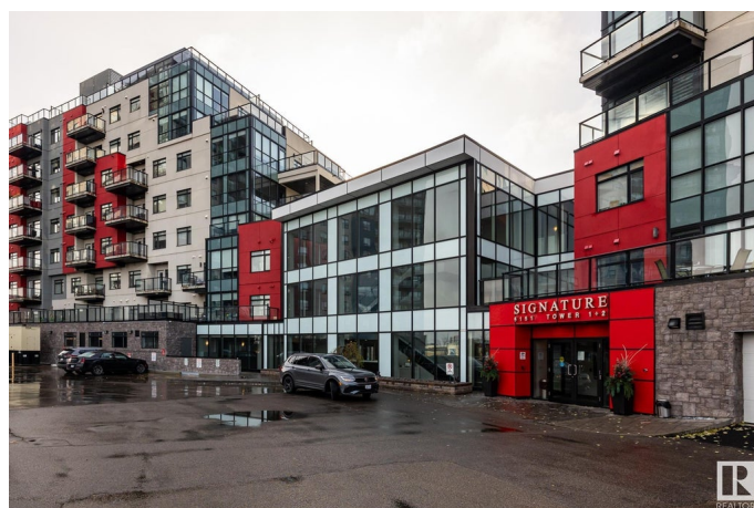
122-5151 Windermere Blvd, Edmonton, AB

Main Building: Total Interior Area Above Grade 2289.74 sq ft