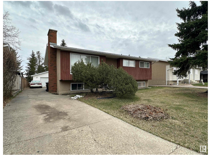
132 Richfield Rd NW, Edmonton, AB

This property could be a great purchase for the right buyer. Although it requires updating, as it is mostly in original condition, yet is located on large, 7,148 sq.ft ( 664.06 sq.m.) lot backing walking path with steps to Bhullar Park. Fantastic, double detached, oversized (23.3' by 23.3' interior) garage was built with permit in 2002. Main floor offers living room with wood burning fire place, kitchen, 3 bedrooms and 1 and a half baths. Basement is fully developed and has large windows. Located close to schools, transportation and good proximity to Whitemud Drive and Anthony Henday highway. Property is being sold in "as-is" condition. Make a move and build some sweat equity!