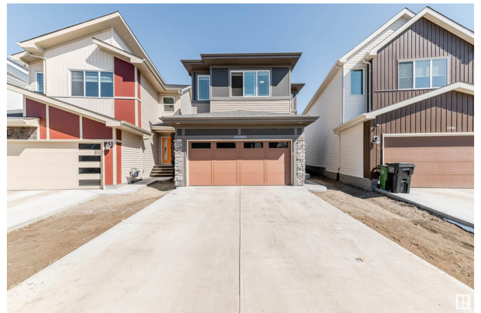
2023 157 St SW, Edmonton, AB

Main Floor Exterior Area 1046.51 sq ft Interior Area 973.00 sq ft Excluded Area 428.21 sq ft