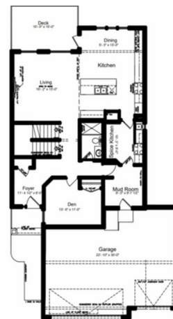
Main Floor Plan